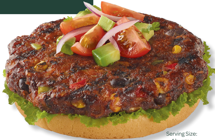
Serving Size: 1 burger

As consumers look towards familiar flavors and nutritious options, the Chipotle Black Bean Burger delivers on all fronts.