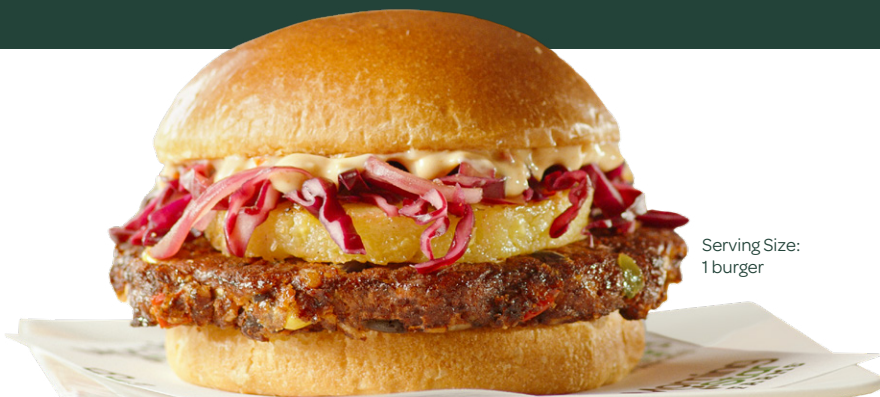
Serving Size: 1 burger

INGREDIENTS: WATER, ONIONS, COOKED BLACK BEANS (BLACK BEANS, WATER), COOKED BROWN RICE (WATER, BROWN RICE), CORN, SOY PROTEIN CONCENTRATE, TOMATOES, WHEAT GLUTEN, ONION POWDER, VEGETABLE OIL (CORN, CANOLA AND/OR SUNFLOWER OIL), GREEN CHILES, SOY PROTEIN ISOLATE, BULGUR WHEAT, CORNSTARCH.