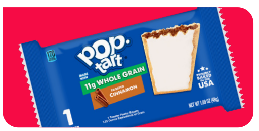
*See nutrition facts panel for full nutritional information.