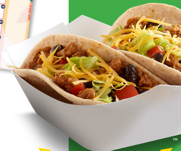
Black Bean Crumble Tacos

Download our recipe sheets for simple, fun menu ideas. Plus you'll find product guides, menu templates, tips to help your operation be more environmentally friendly, and additional resources to spark your own culinary inspiration.