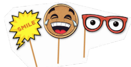
PHOTO BOOTH PROPS

Download and print these age-appropriate activity sheets, trading cards, stickers, and photo booth props to use in the cafeteria or classroom.