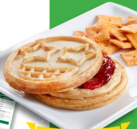
Eggoji™ PB&J Sandwich