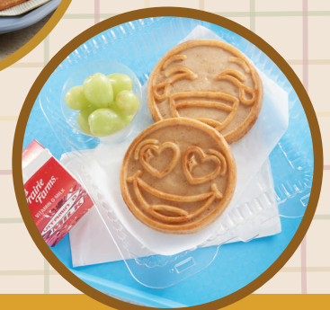
Eggo® Eggoji™ Waffles Made With 16g Whole Grain, 1 cup fruit, milk