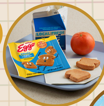
Eggo® Minis French Toast Original, 1 cup fruit, milk