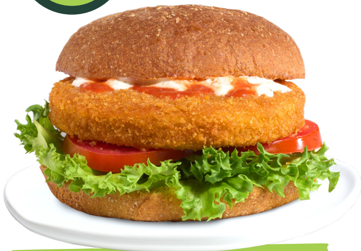
VEGGIE WHOLE GRAIN BREADED SPICY CHIK'N PATTY