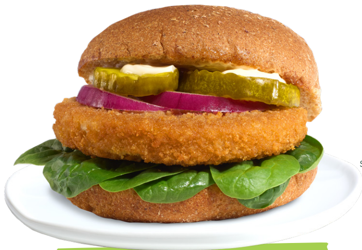
VEGGIE WHOLE GRAIN BREADED ORIGINAL CHIK'N PATTY